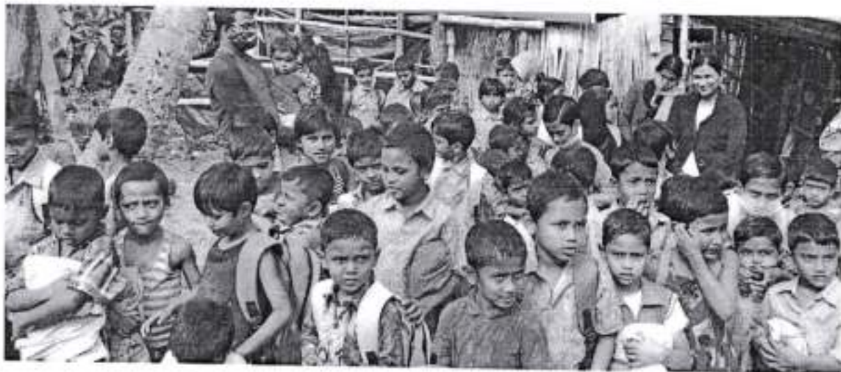
South 24 Parganas Cloth Distribution Programme Moment