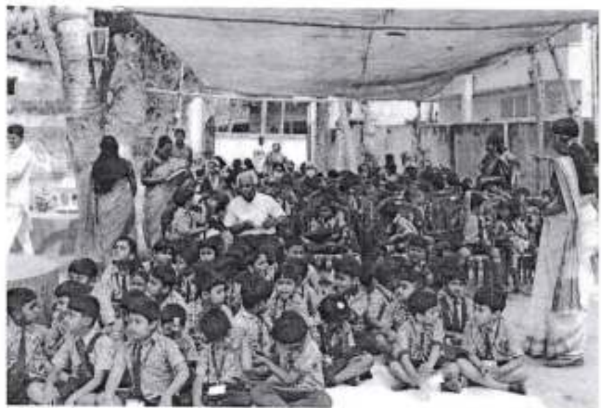
Students at Village Model School participated on 08 th March