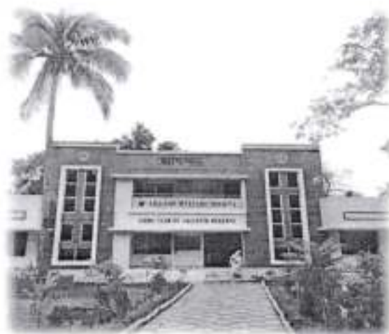
The Old Age Home of VWS, Anandam

VWS has been working with aged women members since the year 1993 with an integrated approach for their better life providing basic facilities along with other services of regular health check-up, recreation like songs, yoga, games, reading of newspapers, exposure visit etc, through an old age home.