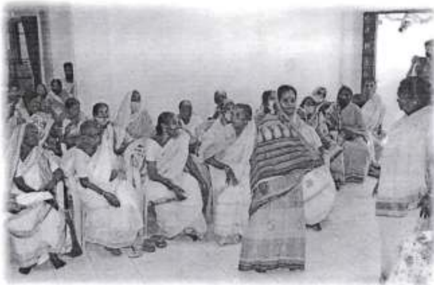
Role Play by the Old Age Inmates on 08 th March